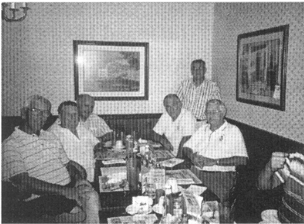
Al Brodhag/Knight Times